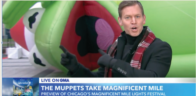
Preview of Chicago's Magnificent Mile Lights Festival on Good Morning America