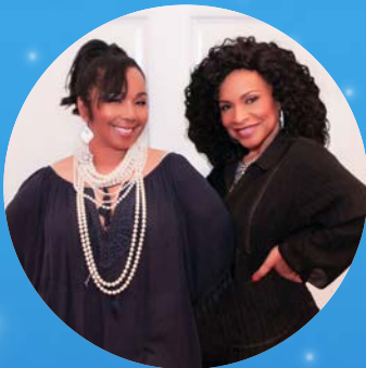
THE LADIES OF CHIC