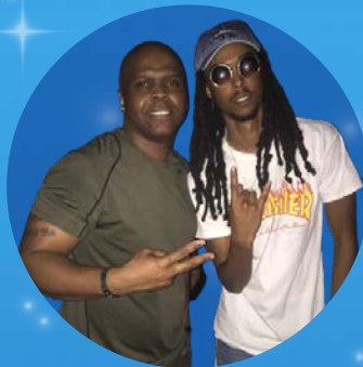
QUAD CITY DJS