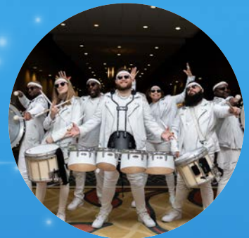
THE PACK DRUMLINE